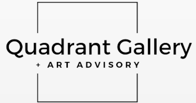
EXHIBIT AT QUADRANT GALLERY